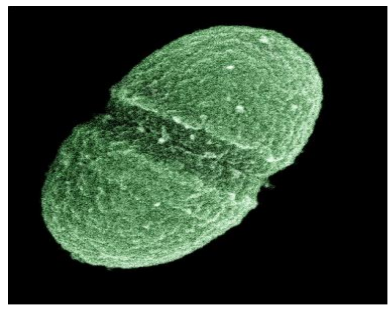
Figure 1: Biofilm formation in enterococcus faecalis Source: Andrew and Horder, (1906); Schleifer and Kilpper-Balz, (1984).