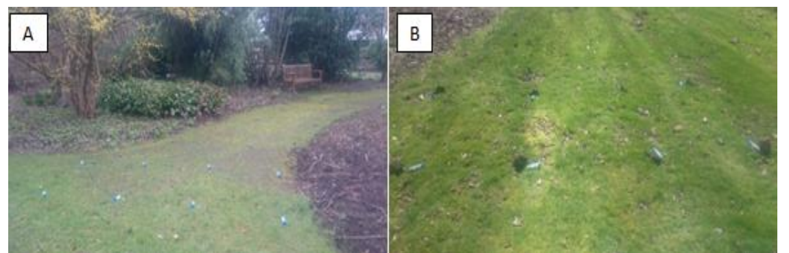
Figure 1 Soil sampling sites. Soil samples were collected from Dundee Botanic Garden for the isolation and identification of biosurfactant-producing pseudomonads. Figures A and B show the sample collection points.

In order to isolate Pseudomonas spp. from soil samples, serial dilutions were performed and an aliquots were inoculated on Pseudomonas selection agar (PSA+CFC) plates using the spread-plate method. At least 7 to 8 colonies were carefully selected from each plate to minimise possible biological replicates and were re-streaked on PSA+CFC. A total of 251 bacterial strains were isolated and screened for biosurfactant expression using the drop-collapse assay.