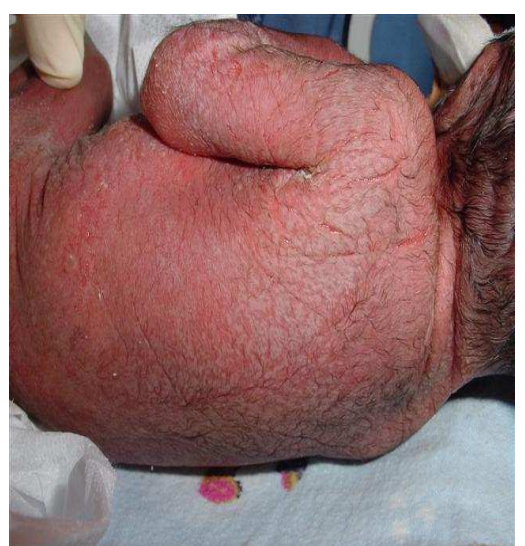
Neonatal candida infections: NZMJ, 2005

yielded fungal agents and were identified as Candida spp . Fifteen of the positive fungal cultures were from male infants with a male:female ratio of 1.3:1. From the study, all the 27 positive Candida cultures were from neonates who met the criteria for invasive candida infection (ICI). As such the prevalence of ICI in this study was 2.3% of the septic neonates. The research also revealed that, there were 21(77%) C. albicans and six non albicans , of which two were Candida krusei . Twelve (44.4%) of the 27 Candida positive neonates were preterm among.