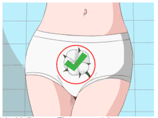
nith, 2017 The cotton tight cotton Gynecologists: "Vaginitis: Causes and

Ugwa, (2015) in Kano, had a study on 300 women, out of which 30 were drop-outs due to consent issues with husband and 90% (270/300) completed the study. The culture in many parts of Northern Nigeria is that the husbands consent is required about aspects of the woman's reproductive and sexual health. According to his findings, vulvovaginal candidiasis (VVC) constituted 84.5% of all HVS specimens which represents a significant percentage and therefore of public health concern.