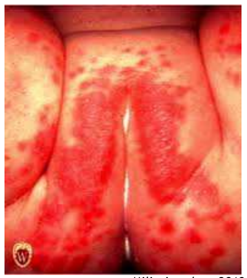
Miliaria rubra, 2018

In what seems like multiaetiologic agent analysis in Cross rivers, Usanga et al. (2009) worked on 562 pregnant subjects and 108 nonpregnant ones, 250(44.5%) and 51(47.2%) were infected with various aetiologic agents respectively. It was observed that in pregnant women, Candida albicans had the highest infection rate 121(21.5%), followed by HIV 38(6.8%) and Chlamydia species, 35(6.2%). Others were Trichomonas vaginalis 29(5.2%): Gardnerella vaginalis (Bacterial vaginosis) 12(2.1%); Hepatitis B Surface Antigen (HBsAg); 8(1.4%) and Treponema pallidum (syphilis) 7 (1.2%). Nesseria gonorrhoea was not isolated. In the non -pregnant women, Candida albicans also had the highest prevalence rate 23(21.3%) followed by Chlamydia species 11(10.2%); while others in the category were: HIV 9(8.3%); Trichomonas vaginalis 4(3.7%); Hepatitis B surface antigen 3(2.8) (HBsAg) Gardnerella vaginalis, 1(0.9). Neisseria gonorrhoeae and Treponema pallidum were not isolated among women in that group.