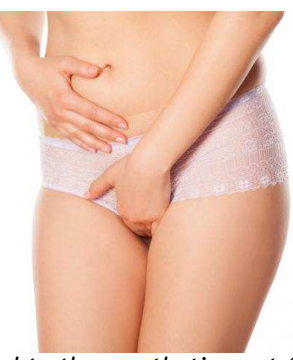
The Nylon tight other synthetic pant (NTSP), Lori Smith, 2017 pant (CTCP), American College of Obstetricians and Gynecolog Treatments." 2019

respectively. While the relative incidence of acute abnormal vaginal discharge among the involved subjects were 25.7% (18 of 191) and 82.64% (100 of 191) for women on cotton tight/cotton pants (CTCP) and tight/other synthetic pants (NTSP) respectively. As part of the results obtained, recurrent abnormal vaginal discharge was found to be 25.7% (18 of 191) and 1.43% (1 of 191) for women on NTSP and CTCP, respectively. C. albican was isolated from 76.86% (93 of 121) of women on NTSP against 42.86% (30 of 70) of women on CTCP as against other agent recovered Trichomonas vaginalis was isolated from 23.14% (28 of 121) of women on NTSP and 17.14% (12 of 70) CTCP. Neiseria gonorrhea was isolated from 4.96% (6 of 121) of women on NTSP and 2.86% (2 of 70) CTCP (Akpan et al., 2011)