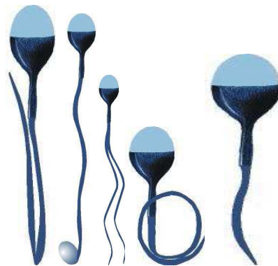
Fig. 3 Abnormal sperm tail containing bent, more Stumped, duplicated and coil Rheubert et al. , 2012; Franken and Henkel, 2012).

Tail aberrations could be in the following forms: coiled, duplicated, stumped, or bent more than 90°C (Rheubert et al. , 2012; Franken and Henkel, 2012).