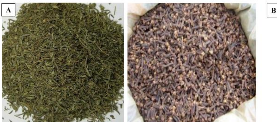
Plate I: Spices used for the study (A) T. vulgaris leaves; (B) S. aromaticum buds

The spices utilized in this study (Plate I) were bought at the Fatima Baika Central Market in Katsina. Plant taxonomists at the Department of Biology, Umaru Musa Yar'adua, Katsina (UMYUK), officially recognized the spices and issued voucher numbers (AN001, AN002) to each. The spices were then stored apart in clearly labeled plastic containers after being cleaned with tap water and allowed to air dry for five days in the laboratory under shade (Soe et al. , 2020).