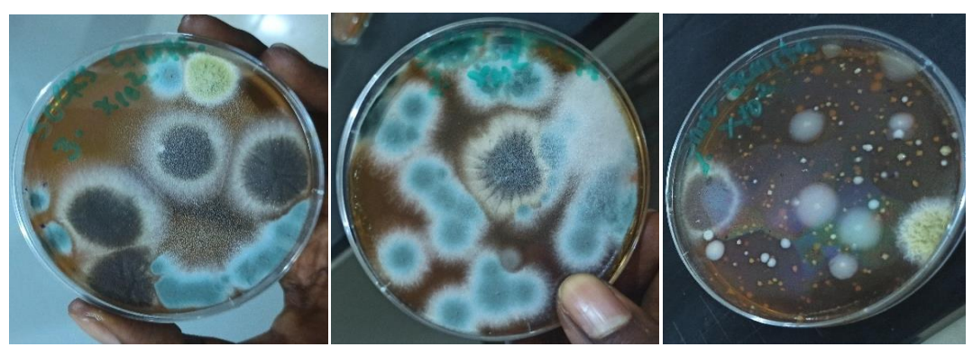
Figure 1(a). Fungal isolates on SDA.

Pseudomonas aeruginosa , also isolated in this study, has been associated with wound infections, and quite a lot are multidrug-resistant (Nkang et al. , 2009). Takashima et al. (2004) found that bound S. aureus and P . aeruginosa have a high affinity to polyester or acrylic fibers (> 80%) but low to cotton fibers (< 10%).