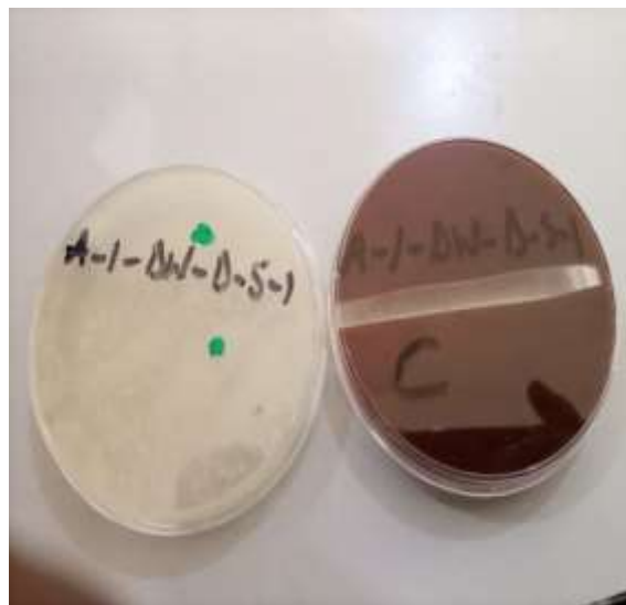
Figure 2: An overnight cultured plates (Nutrient and Heated blood agar)