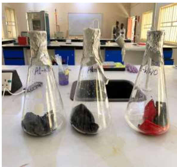
Figure 1: Samples soaked in sterile peptone water

The microbial analysis involved biochemical and molecular techniques to accurately identify the species present. The microbial analysis involved various organisms incubated under specific conditions to determine colony counts. Mesophilic bacteria were cultured on Plate Count Agar at 36°C for 72 hours, with total colonies counted. Fungi (molds and yeasts) were incubated on Sabouraud Dextrose Agar at 25°C for 7-10 days, and mold and yeast colonies were enumerated. Anaerobic bacteria were incubated on Plate Count Agar at 36°C in anaerobic conditions for 72 hours. Coliforms were identified on Chromogenic E. coli /Coliform (C-EC) medium at 36°C for 24 hours, with blue colonies counted. Escherichia coli colonies, both blue and fluorescent, were similarly counted using a Wood lamp. Staphylococcus spp. were identified on Baird Parker Agar at 36°C for 48 hours, with black colonies counted. Candida albicans was cultured on Biggy Agar at 36°C for 48 hours, with dark brown colonies enumerated. Finally, Pseudomonas aeruginosa was grown on Pseudomonas Agar at 36°C for 48 hours, and green-blue colonies were confirmed biochemically under a Wood lamp by identifying fluorescent and reddish-brown colonies.